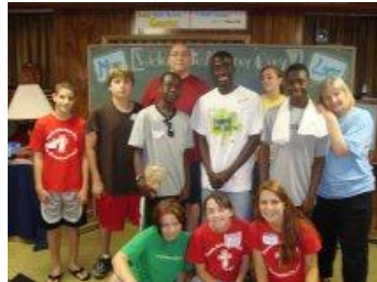
Youth Mission Team

"And the King shall answer them, "Truly, I say to you, as you did it to one of the least of these my brothers, you did it to me." Matthew 25:40