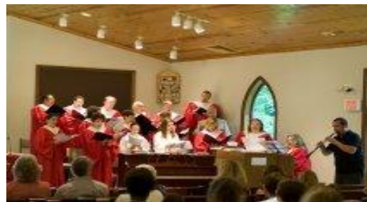
The choir & accompanists

We primarily use the 1982 hymnal and "Lift Every Voice and Sing" (LEVAS) II hymnal, but the choir sings anthems from many sources. Keyboard instruments such as the piano and electronic organ are customary accompaniments to the choir. Our music is sometimes supplemented with the tone chime choir, and the talents of children and adults who play string and wind instruments. This is an area