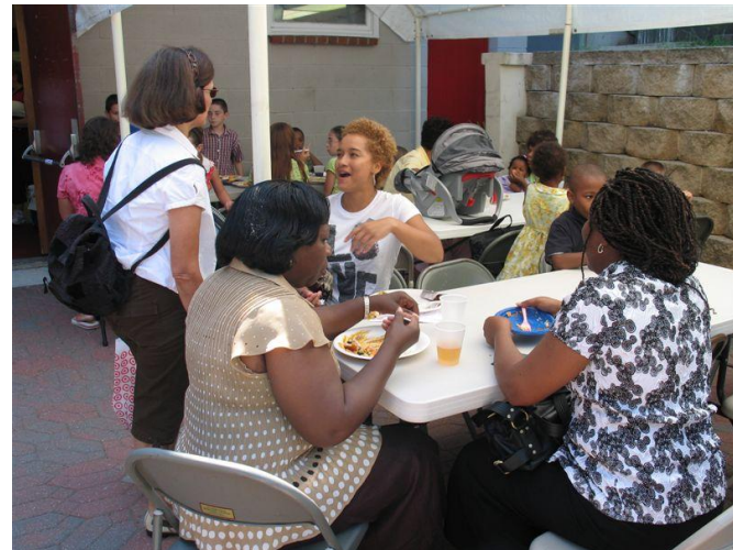
Annual Rally Day Parish Picnic on church patio

together to serve the community and beyond. Youth play a vital role here at St. Barnabas because we believe the youth are an important part of our ministry.