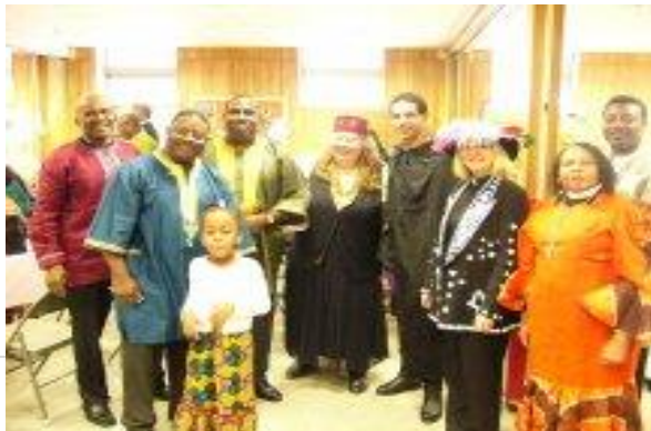
International Sunday Celebration

St. Barnabas enjoys its diversity and celebrates it. We are diverse in a variety of ways: economically, racially, and generationally. However, we all find common ground in Christ and truly enjoy each other's company and learning from each other. We have an active Ministry of Racial Diversity team which strives toward racial awareness and frank discussions. We organize events such as International Sunday, when folks are invited to bring food from their culture during coffee hour and discuss some of the traditions in their cultures. We enjoy many fellowship activities together like progressive dinners, summer barbecues, Shrove Tuesday pancake suppers, Maundy Thursday agape dinners, spaghetti dinners, Rally Day picnics in September, and St. Nicholas Day. Whatever the activity in the future, we have a strong desire to spend time together as Jesus leads us.