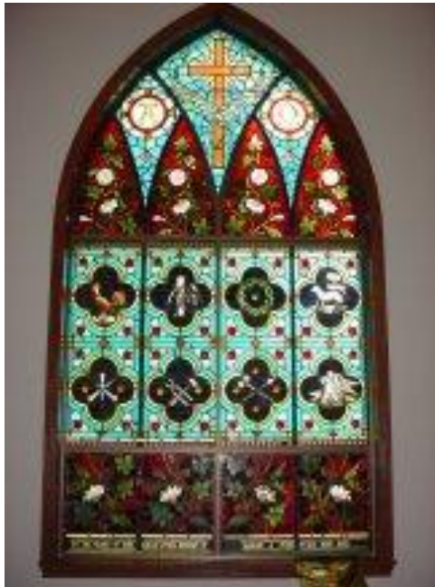
Our original stained glass window