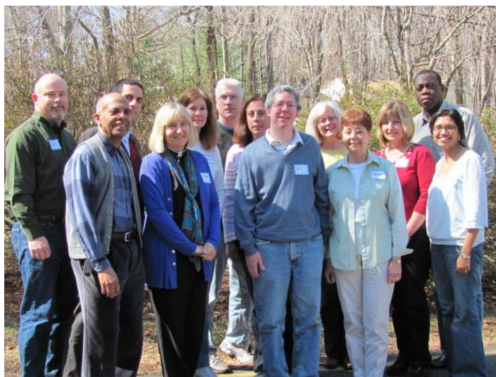
St. Barnabas Vestry and Interim Rector

At present, the staff of St. Barnabas consists of the Interim Rector, a Deacon, Minister of Music, and Office Manager. There are two Wardens, nine Vestry Members and Treasurer to guide and support the overall mission of the church. In addition, a retired Priest Associate assists with services throughout the year as needed.