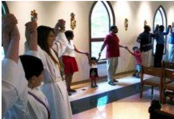
Parishioners hugging our church at the 138 year birthday celebration

The survey also showed some areas for improvements. These included an acknowledgement that we need to drop ministries that are no longer effective; strive toward obtaining a professional youth minister to assist in giving our children a stronger sense of Jesus Christ in their lives; and place more emphasis on adult Christian Education.