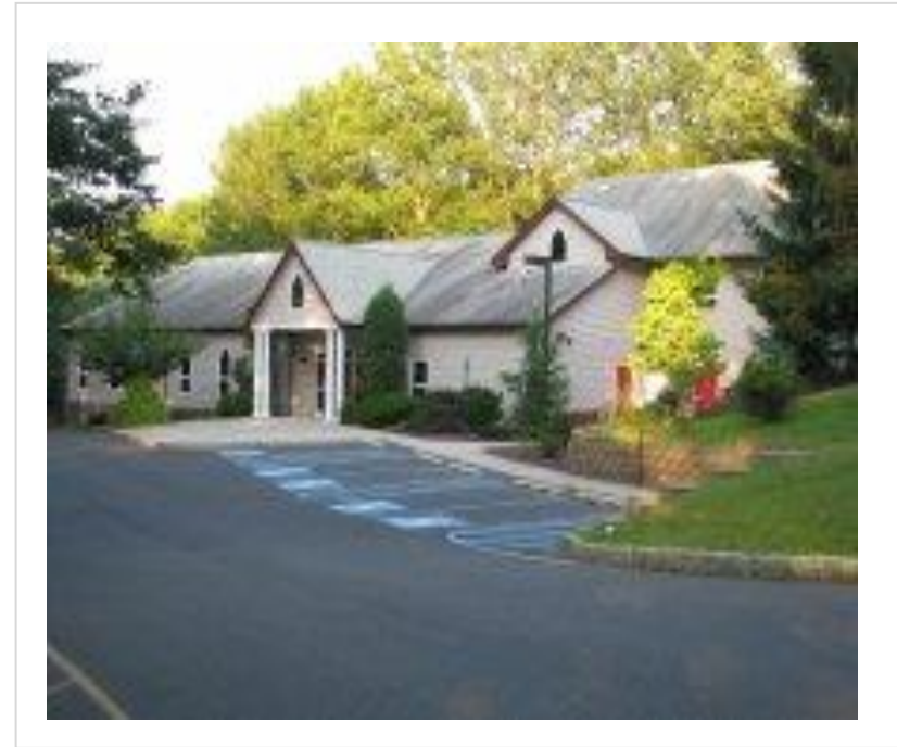
Our new church completed in 2002

sanctuary was renovated into three new classrooms with soundproof walls, so that noise would no longer be a problem during Sunday School. We also refurbished the offices occupied by our rector and the parish office manager.