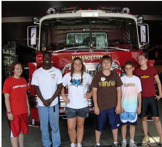
Youth Mission Trip