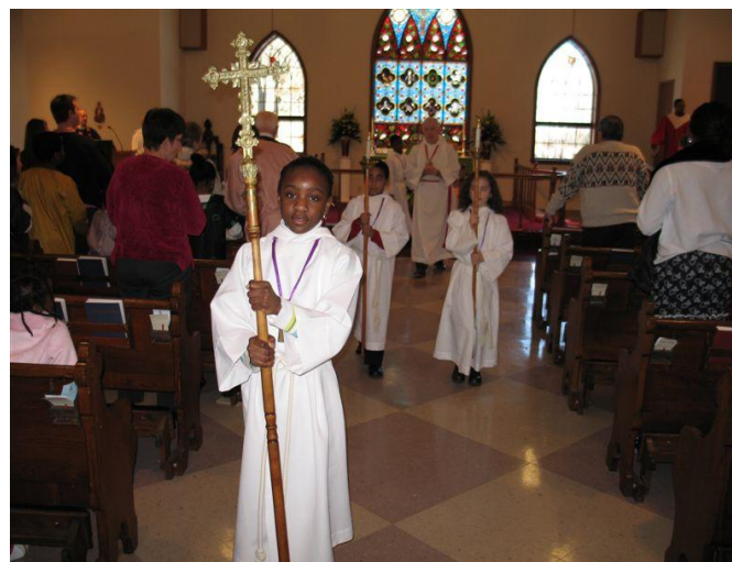
Recessional led by acolytes