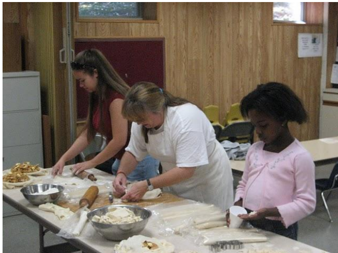
Apple Pie Baking