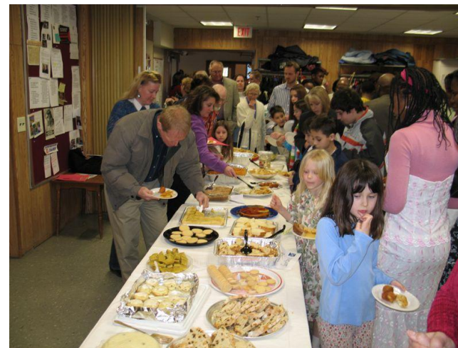
International Sunday Celebration

The age range is from newborns to over 80 years old. Some of our long time parishioners have been attending St. Barnabas since the 1950's. They serve as a very direct connection to the St. Barnabas of the past six decades. The religious backgrounds of our members are varied, coming from at least eight different denominations including Baptists, Catholics, Episcopalians/Anglicans, Jewish and Pentecostals.