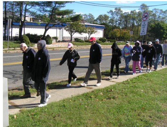
Crop Walk for Hunger