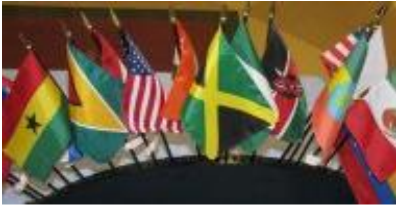
Flags representing our countries of origin

Today, as the church celebrates its 138th Birthday in 2010 we are grateful to be an Episcopal parish within the Diocese of New Jersey. We look forward to welcoming new members (we have room now!) and reaching out to the community and beyond while maintaining the warmth and friendliness that has always characterized our church.