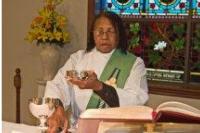
Communion at the altar

our stained glass window was salvaged from it and installed behind the altar.